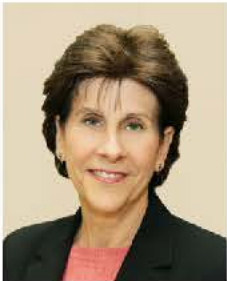
President and CEO, Davie Community Foundation