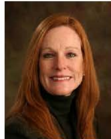
Chief Financial Officer, Woodard and Company Asset Management Group