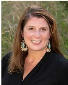
Owner, Hillsdale Real Estate Group